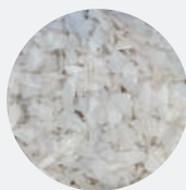
Natural Color HDPE Flake