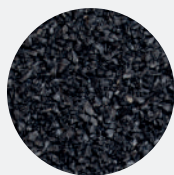
Injection Grade HDPE/PP Re-grind