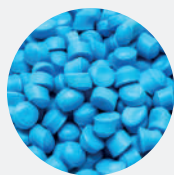
Custom Pre-Colored Formulations