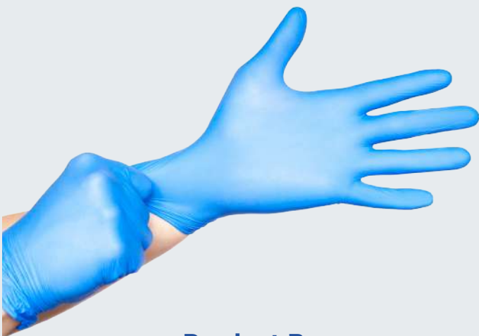
Product Box 100 gloves