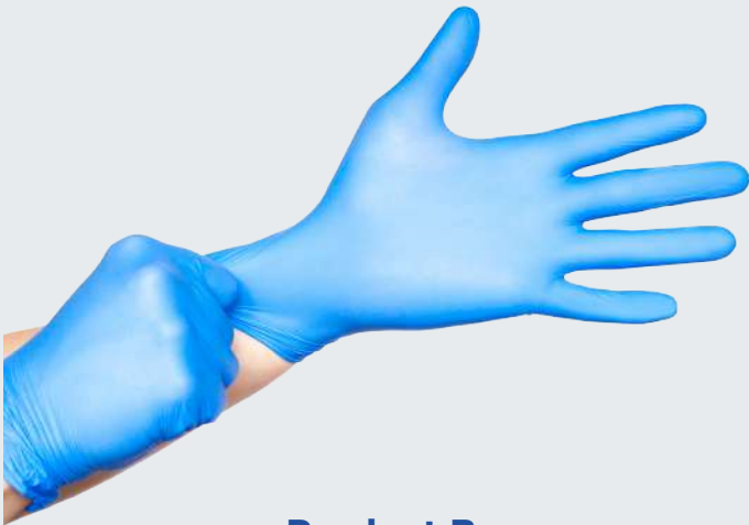
Product Box 100 gloves