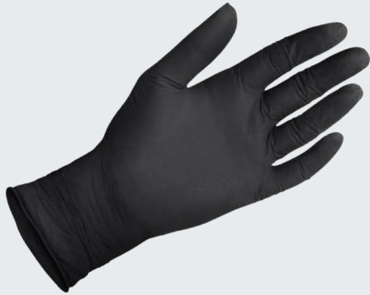
Product Box 100 gloves